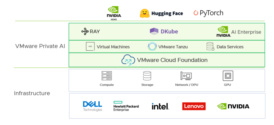
Figure 2: VMware Private AI Reference Architecture

VMware Tanzu enables customers' software supply chain to be more secure - all the way from app development to having their apps running in production. Moreover, the portfolio offers a cohesive developer experience across any Kubernetes to speed application development and delivery cycles.